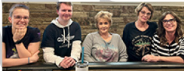
PERPETUAL THANKS, CREW.