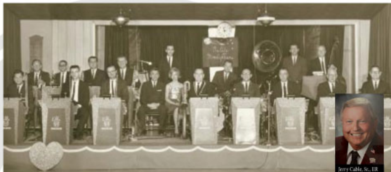
ELKS MOONLIGHTERS, circa 1964.

Happy May to all our Elks members. I wanted to share the following history of our lodge with all of you.